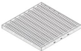
Mesh grating MW 30/10 mm for Gully-extension Type 30 x 30