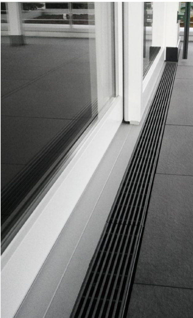
Penthouse in Wiehl, Germany