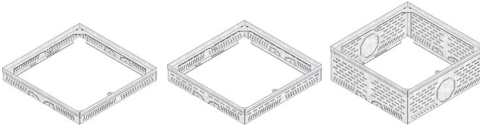
Frame for Gully-extension 40 x 40, type 55