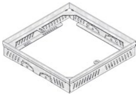
Frame for Gully-extension 30 x 30, type 55