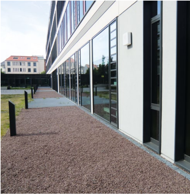
Centre for Conservative Medicine, Leipzig, Germany