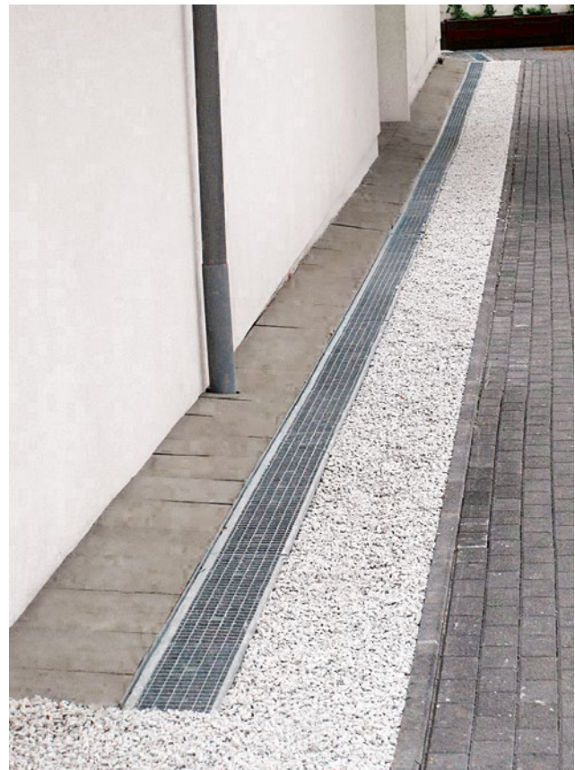
Holiday Inn in Bydgoszcz, Poland