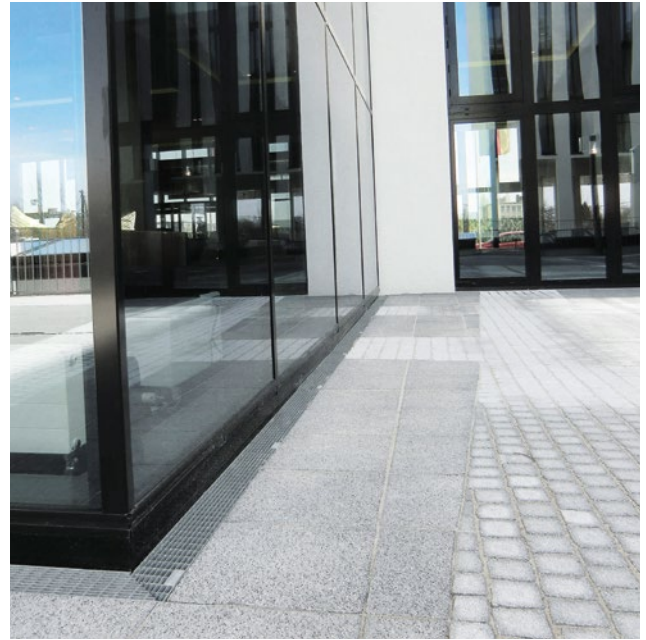
Leonardo Royal Hotel in Munich, Germany