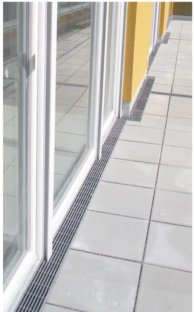
Retirement home Hennet, Germany