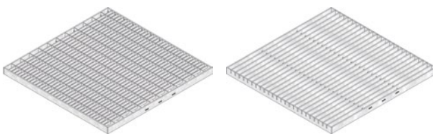
Mesh grating MW 30/10 for Gully-extension Type 40 x 40