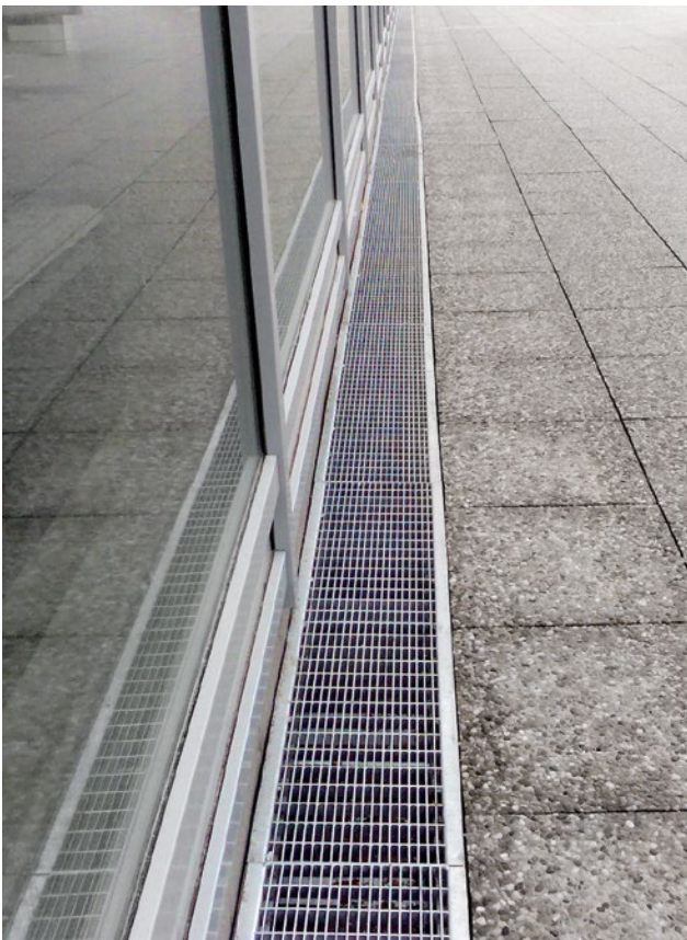
Europa Shopping Centre in Bystrica, Slovakia