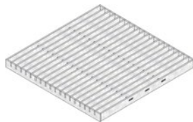
Gully-extension Type 30 x 30 with Longitudinal grating, galvanised