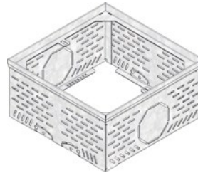
Frame for Gully-extension 30 x 30, type 150